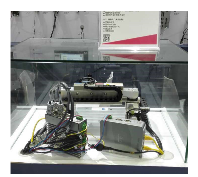
Figure 1: exhibit of the ACS test stage with the RESOLUTE encoder onboard

The latest servo-control algorithms, such as ACS' ServoBoost<sup>™</sup>, provide real-time automatic compensation for changes in load, disturbances, resonances, axes interaction and cogging. This allows faster settling times, sub-nanometre standstill position error (jitter) and reduced following error. ServoBoost<sup>™</sup> and similar algorithms are designed for high performance servo-control applications in the semiconductor inspection, flat panel inspection, electronics assembly and medical diagnostic industries. For instance, a nano-positioning stage for e-beam lithography is typically capable of a minimum step-size of ~1 nm and a settling time of just a few micro-seconds. Factors affecting motion stage performance include stage mechanics such as material stiffness, bearings, straightness and orthogonality of axes, motor-type and encoder errors.